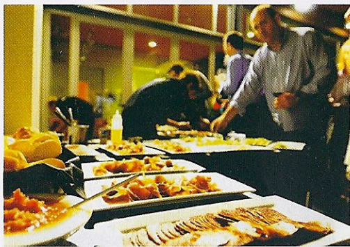
European Film Night at the French Institute