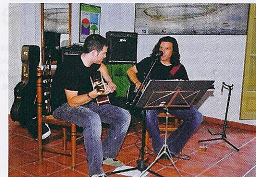
Festival Estival, June 09: performance

Come down and find out what it's all about at the